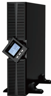
Display panel can be rotated