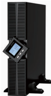
Display panel can be rotated