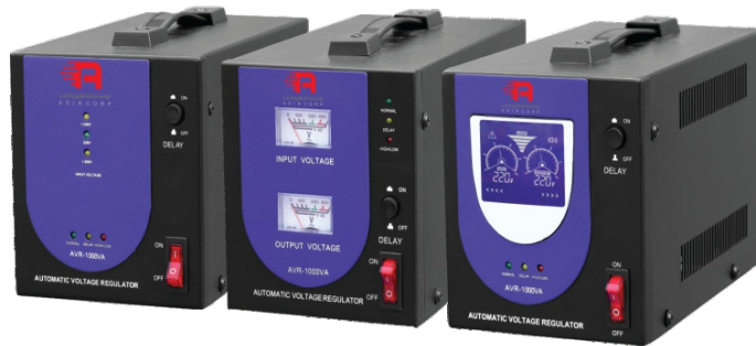
500VA ~ 5000VA

AVR series AC automatic regulators apply the advanced control technology with well qualified components. It has the features of wide input voltage compatibility, high reliability, output voltage stabilizing, energy saving etc.; it has over voltage and low voltage protection and delayed output protection etc.. it could supply stabilized power to lights, TVs, air-conditioners, refrigerator, computers and duplicating machines and other household equipment in schools, offices, hotels, meeting rooms where the stabilized voltage is needed.