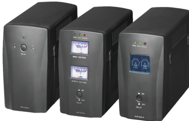
500VA ~ 1000VA